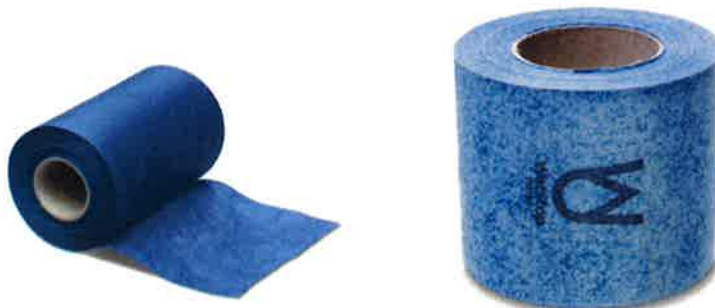
Picture 1. The waterproofing reinforcement tapes used in the tests.

The test results relate only to the sample tested.