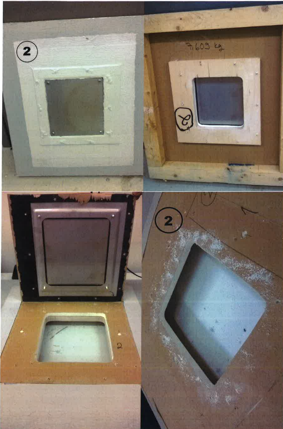
Picture 2. Test specimen no. 2 after testing.

The test results relate only to the sample tested.