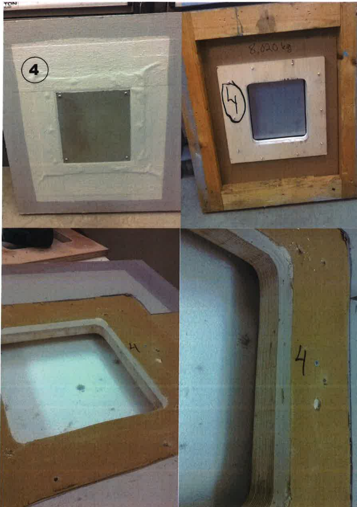
Picture 4. Test specimen no. 4 after testing.

The test results relate only to the sample tested.